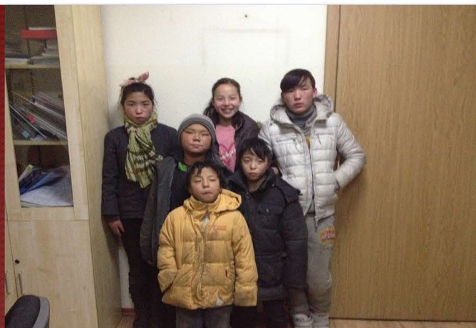
Before and after receiving Winter Kits